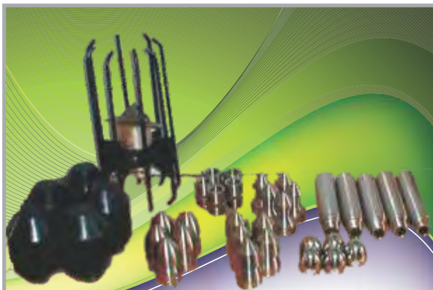
NOZZLES AND CUTTERS