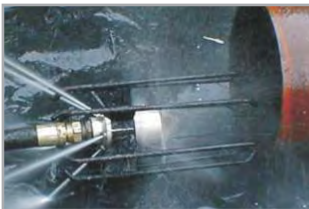
DRAIN CLEANING : A CLOSER LOOK

We may point out here that our Jetting system has imported triplex pumps from MYERS, U.S.A. known for over 150 years. This pumps have been offered in all Sewer Cleaning Units supplied by us till date in India.